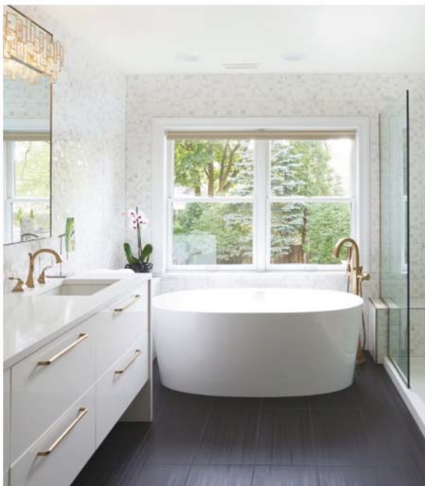
Top: The new MOD+ Collection from GRAFF comes in multiple finishes, including the of-the-moment architectural white shown above. The handles feature Tuscan marble in three different colors on brass bases with tactile knurling. Middle: GRAFF's Harley collection is inspired by the classic American motorcycle, and comes in finishes such as the elegant Onyx, shown here. Left: In a master bath by Hilary Bailes , a freestanding tub by Victoria + Albert (House of Rohl Studio) looks out on a lush garden. The small space is artfully designed, with tile by Porcelanosa and glossy white finishes on cabinets and surfaces. Brass fixtures by House of Rohl Studio add a touch of old world elegance.